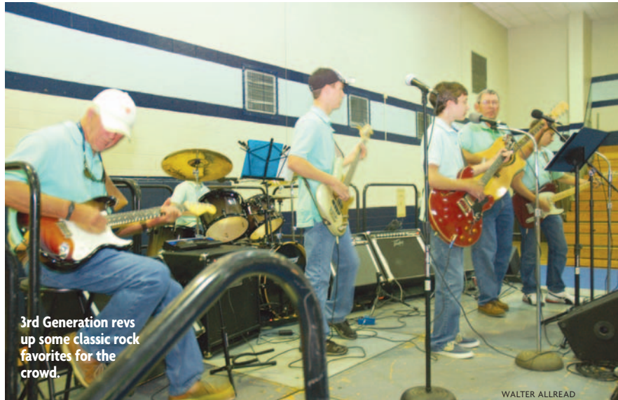
3rd Generation revs up some classic rock favorites for the crowd.